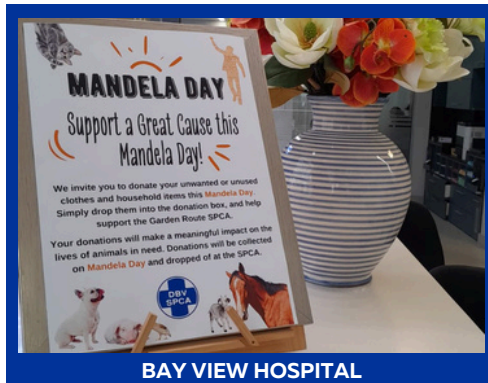
BAY VIEW HOSPITAL