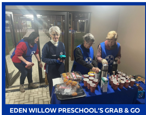
EDEN WILLOW PRESCHOOL'S GRAB & GO

Let's continue to work together to ensure a brighter future for all animals in our community.