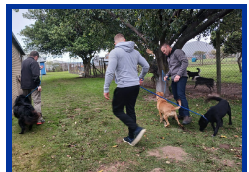
DENNEOORD NEIGHBOURHOOD WATCH