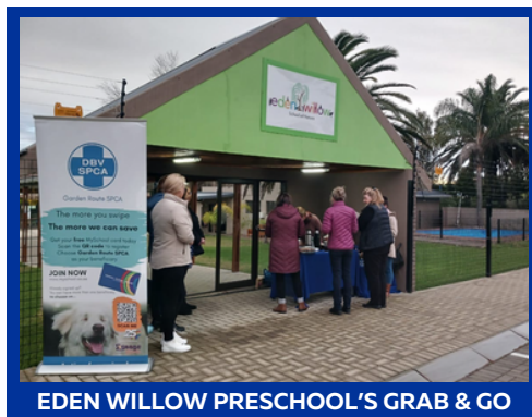
EDEN WILLOW PRESCHOOL'S GRAB & GO

Denneoord Neighbourhood Watch's Community Effort: Denneoord Neighbourhood Watch organized designated donation boxes at Wellington Spar George and Wellington Multisave throughout July. These boxes collected essential items such as cat and dog food, blankets, and toys. On Mandela Day, they gathered these donations and visited our SPCA, spending valuable time with our animals and even taking our dogs for a walk. Your commitment to our cause and the well-being of our animals is truly commendable.