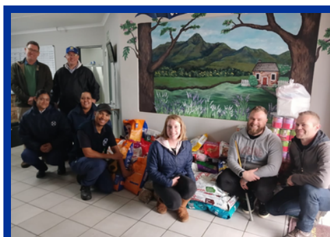
DENNEOORD NEIGHBOURHOOD WATCH