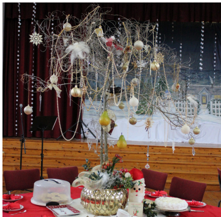
Table décor (done by Moira Gibbs and Delene Simpson) – Partridge in a Pear Tree or Pear in a Partridge Tree!