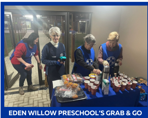
EDEN WILLOW PRESCHOOL'S GRAB & GO