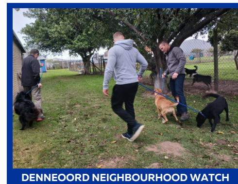
DENNEOORD NEIGHBOURHOOD WATCH