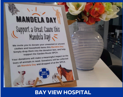
BAY VIEW HOSPITAL