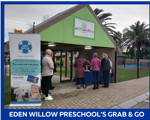
EDEN WILLOW PRESCHOOL'S GRAB & GO

Let's continue to work together to ensure a brighter future for all animals in our community.