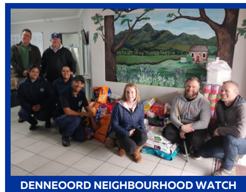
DENNEOORD NEIGHBOURHOOD WATCH